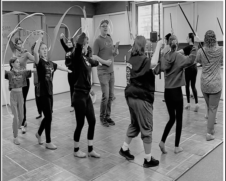
"Give My Regards to Broadway" cast practice dance numbers.

The performance will take place at the Grace United Mission Center on May 5th and 6th at 7 pm both nights. Admission will be $6 at the door, and desserts will be served as always.